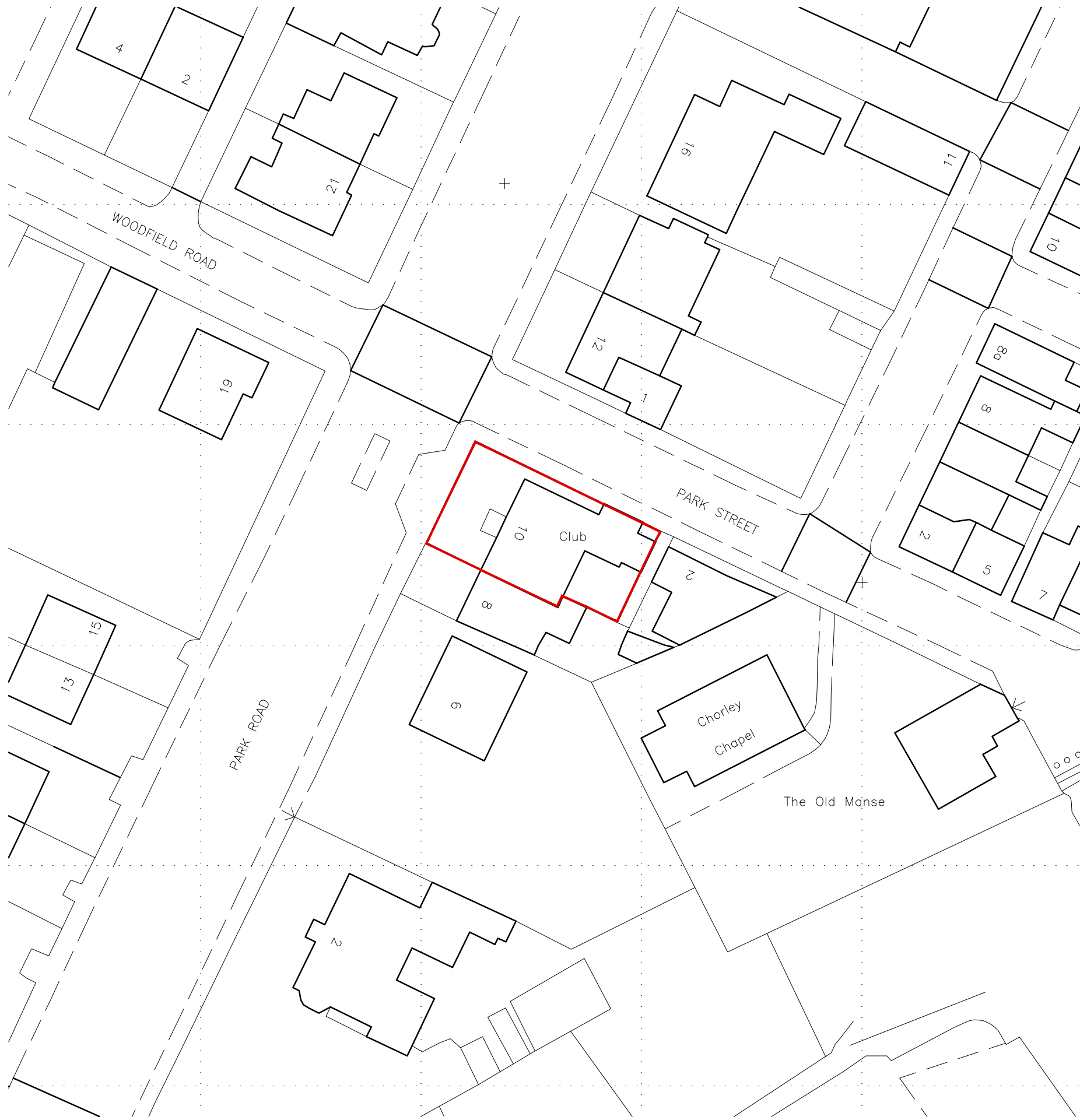
Site Layout 1:500