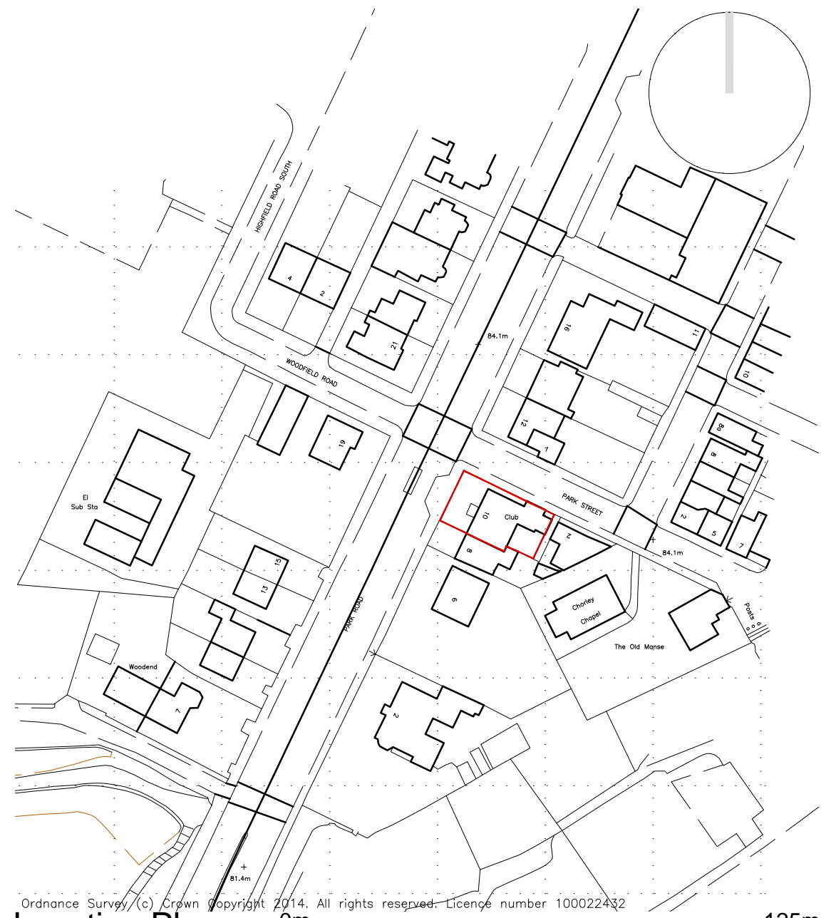
Ordnance Survey / (c) Crown Copyright 2014. All rights reserved. Licence number 100022432 Location Plan 0m 125m 1:1250 Scale: 1:1250